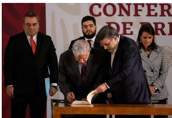
Mexican President López Obrador signs a decree forbidding tax amnesty programs.

These tax amnesties were characterized by a lack of transparency: public officials initially refused to release even the total amounts of debt forgiven. It is now known that one quarter of the total tax forgiveness (between 2007 and 2018) was awarded to a very small group of fifteen taxpayers.