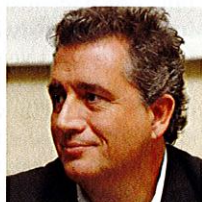
LUIS MIGUEL ETCHVEHERE Minister of agribusiness Argentina